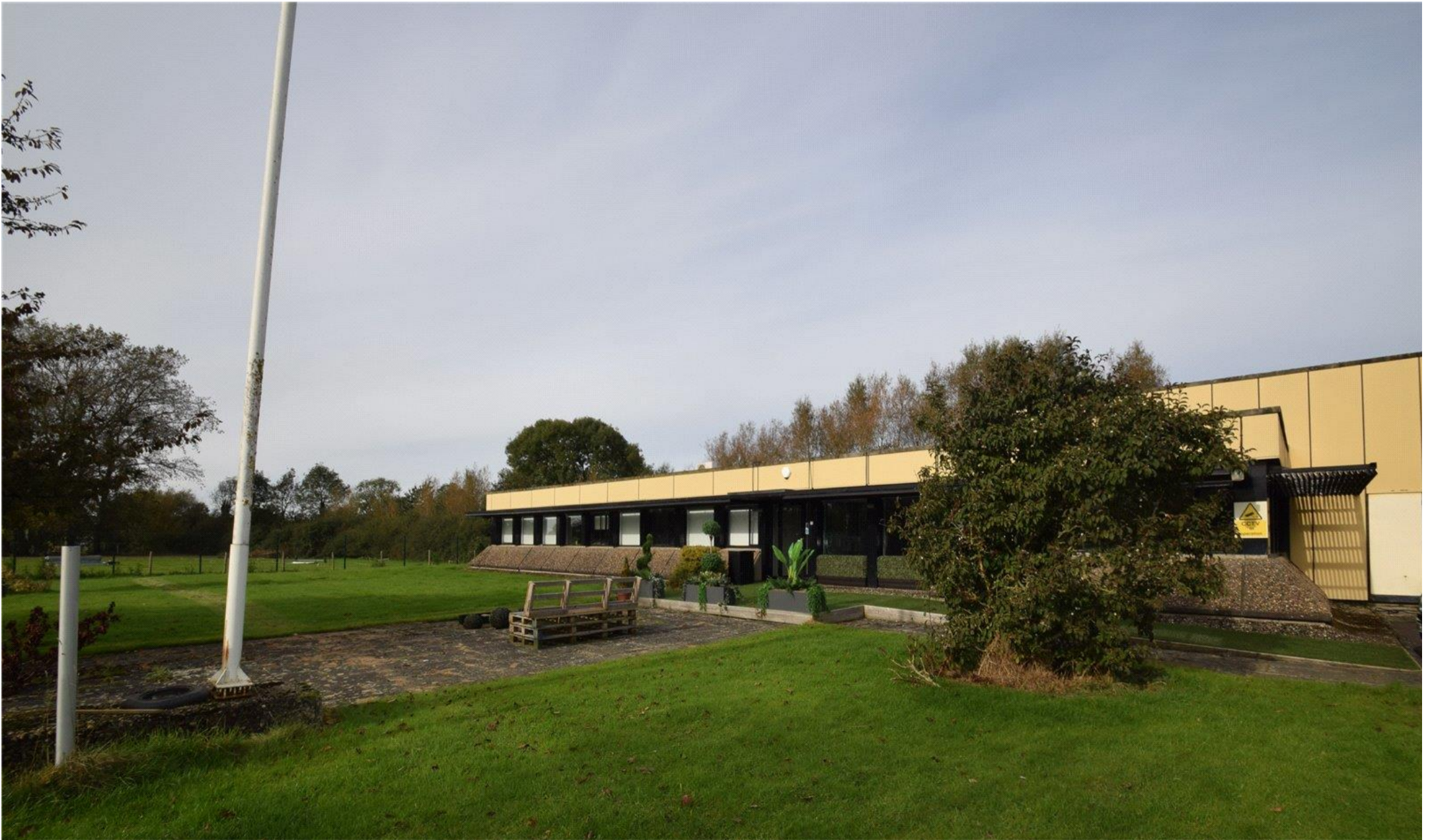
Office Units, Outgang Lane, Pickering, YO18 7JA